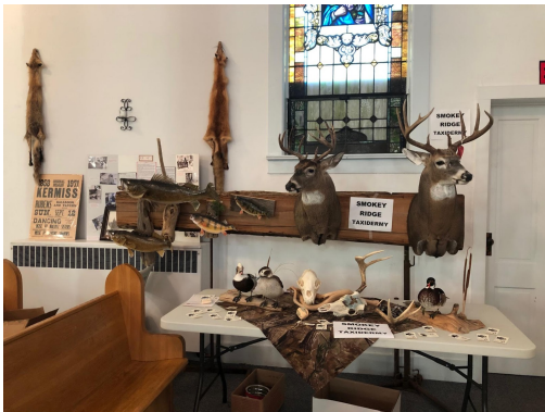
Smokey Ridge Taxidermy displayed mounts at the Hunter's Raffle