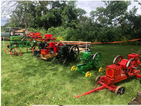
Antique Power Equipment on Display