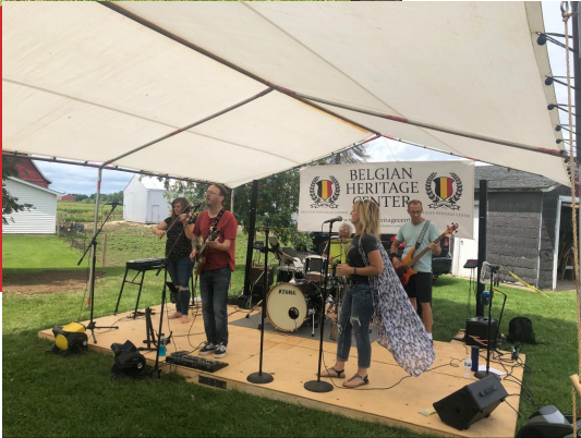
The Mad Cats entertained with their usual excellence and energy at the Kermis!