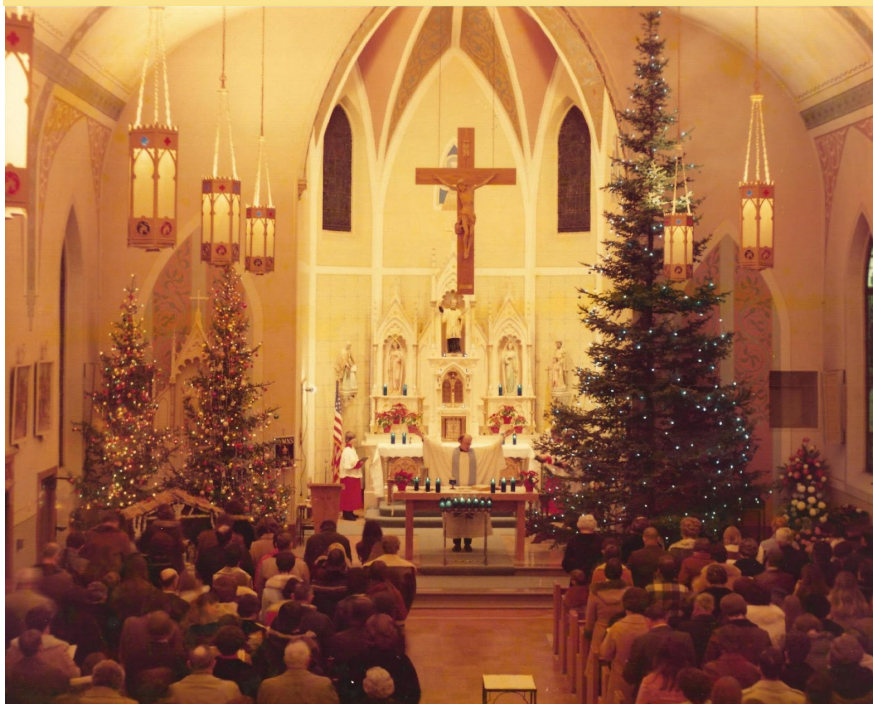
St Francis Church in Brussels at Christmastime 1974

From all of us at the BHC, Joyeux Noel (French) / Djoyeus Noye (Walloon) / Vrolijk Kerstfeest (Flemish)!